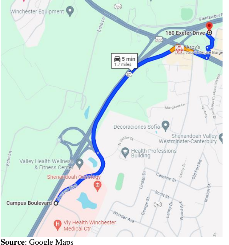
Figure 2. Travel Time Between Current and Proposed Location

2. The extent to which the project will meet the needs of the residents of the area to be served, as demonstrated by each of the following: