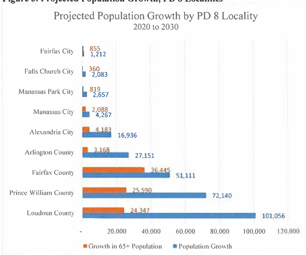
Figure 3. Projected Population Growth, PD 8 Localities