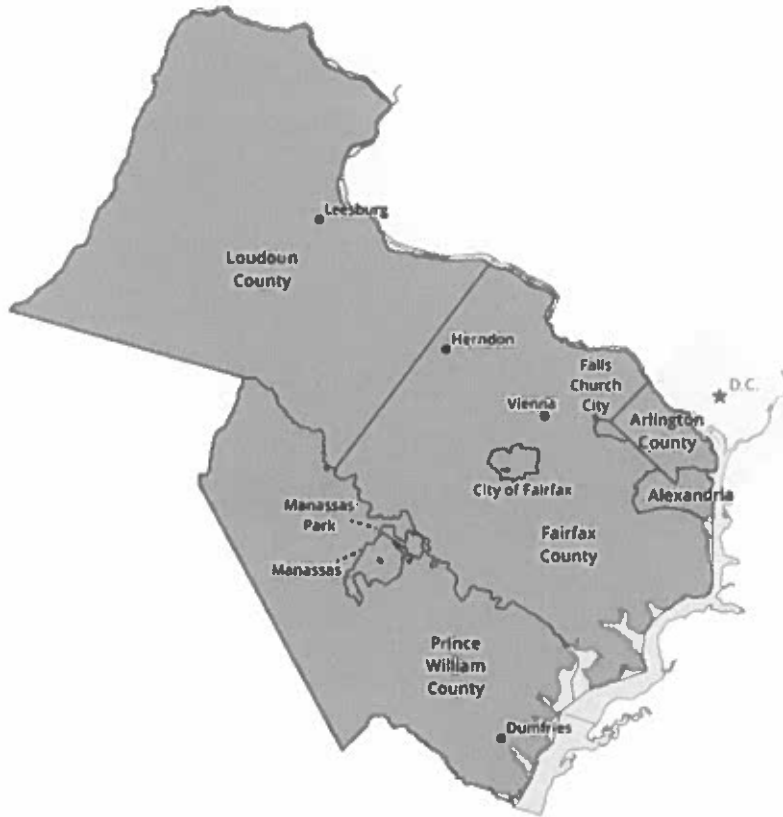
Figure 1. City/County Boundaries in PD 8