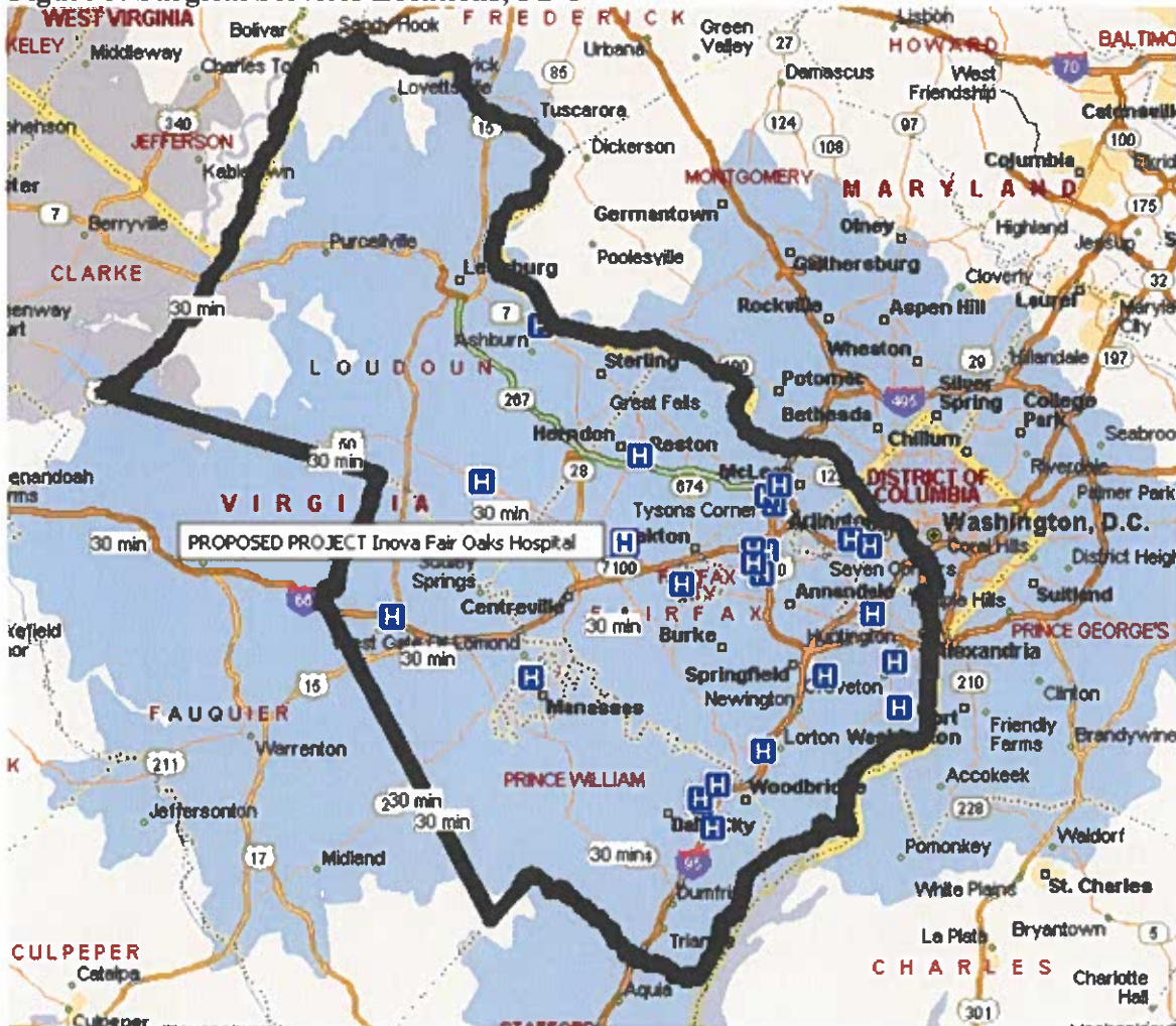
Figure 3. Surgical Services Locations, PD 8