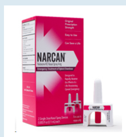
OTC Narcan ®

All OTC medications are packaged with instructions for use and additional information for individuals to use safely.