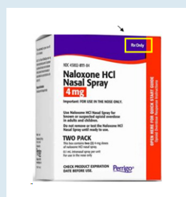
Prescription naloxone generic