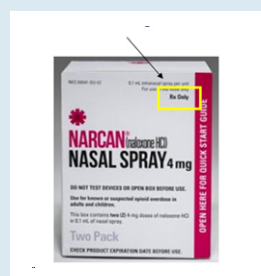
Prescription NARCAN ®

Prescription naloxone will always have “Rx only” on the package, per federal regulations.