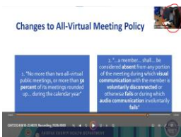
Policy change proposal to Health Care Advisory Board