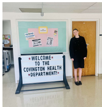
Visited the Covington City Health Department

Accompanied the RCAHD nurse supervisor to a local news station for an interview regarding back-to-school vaccinations